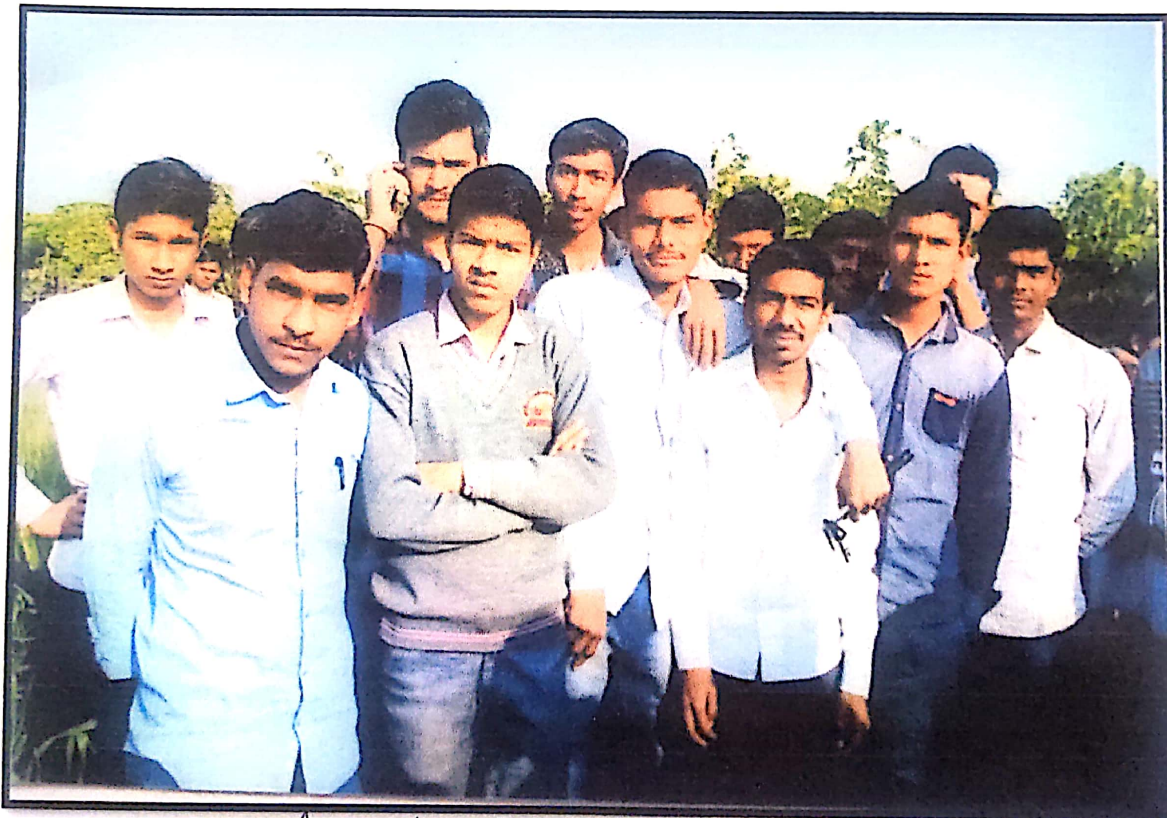
Visit to Adarsha Gram Ralegan siddhi, Ahmednagar.

PRINCIPAL Nutan Mahavidyalaya SELU, Dist. Parbhani